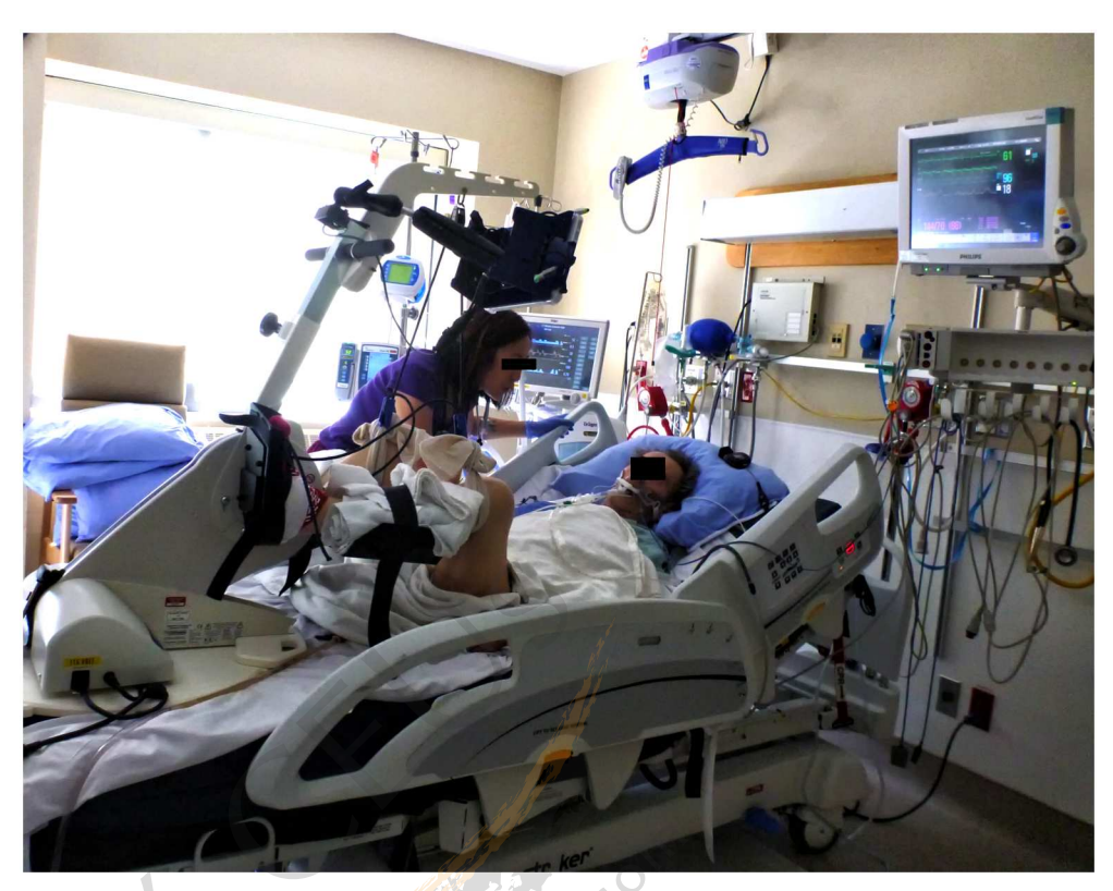
Fig 1. Example of in-bed cycling. This figure demonstrates a patient in the ICU receiving in-bed cycling and mechanical ventilation. An ICU physiotherapist supervises the in-bed cycling session.